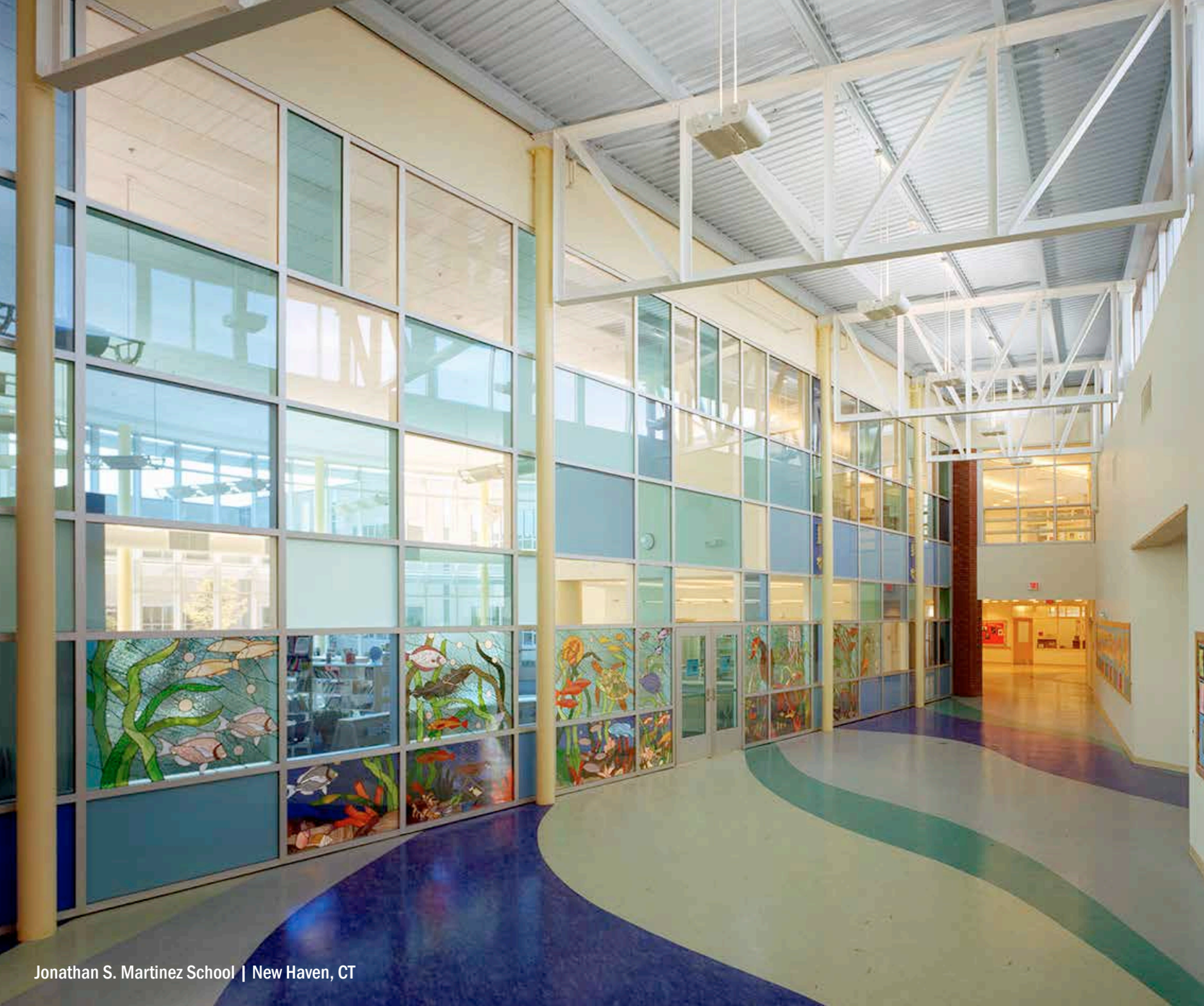
Jonathan S. Martinez School | New Haven, CT