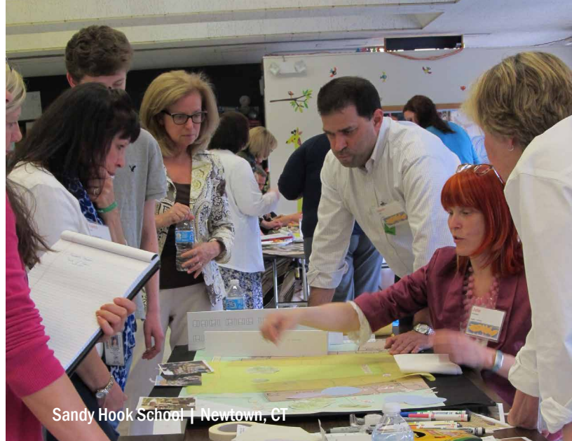
Sandy Hook School | Newtown, CT