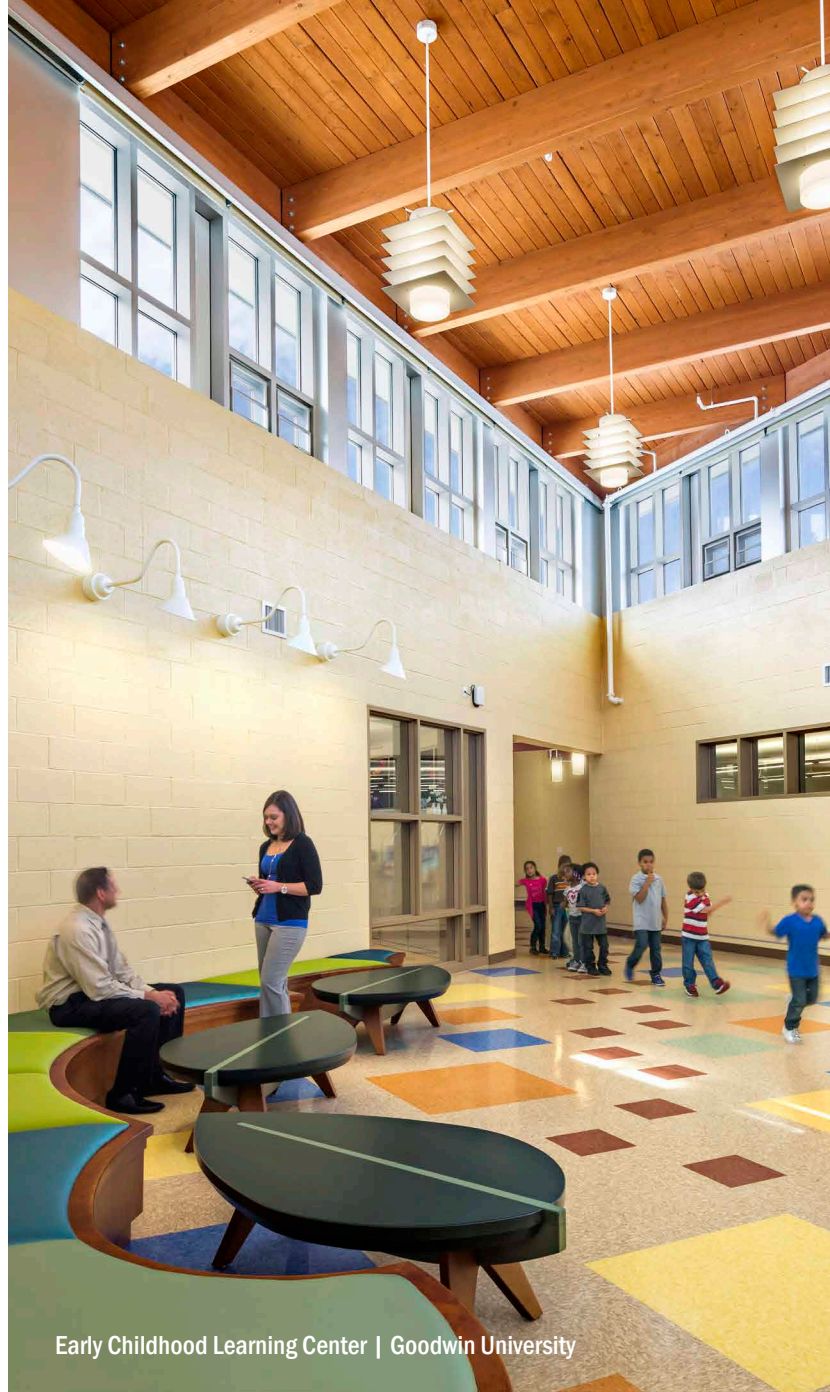
Early Childhood Learning Center | Goodwin University