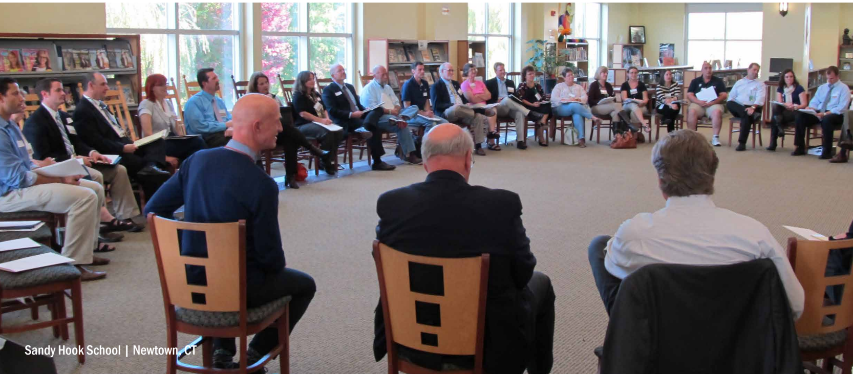
Sandy Hook School | Newtown, CT