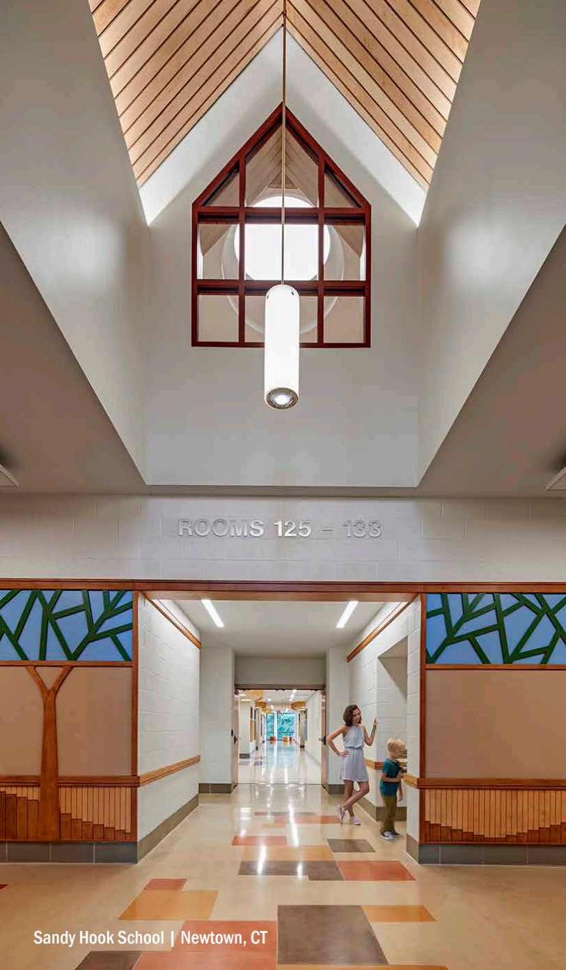
Sandy Hook School | Newtown, CT