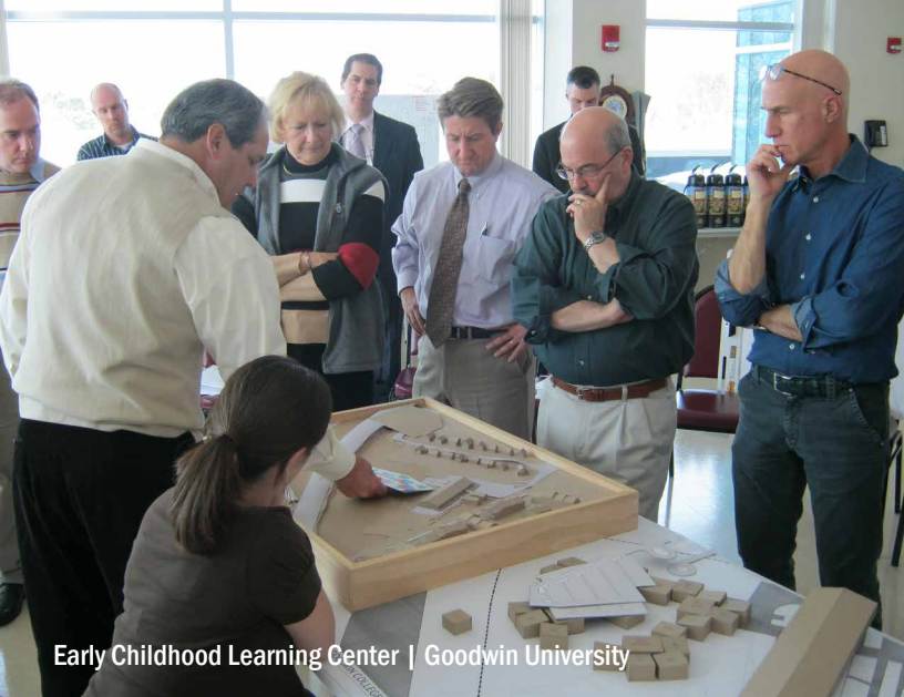
Early Childhood Learning Center | Goodwin University