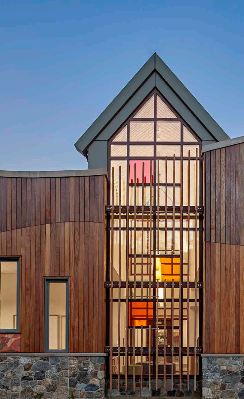
Sandy Hook School | Newtown, CT