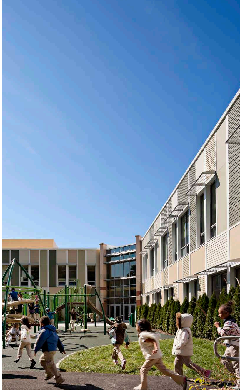
Interdistrict Discovery Magnet School | Bridgeport, CT